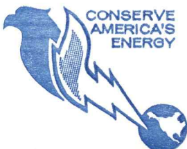
Commissioner of Indian Affairs