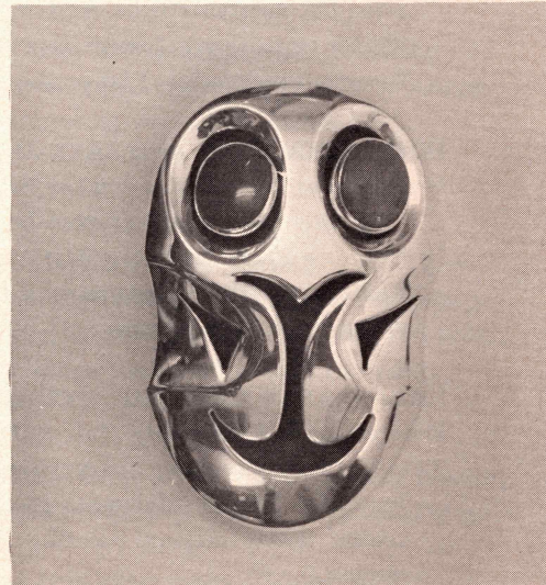
Cherokee, North Carolina - Bear; carved mahogany.

ERRATUM: Eskimo and Cherokee captions are transposed.