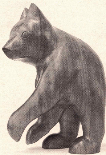
Eskimo, Alaska - Mask pin; sterling silver with jade eyes in raised settings.