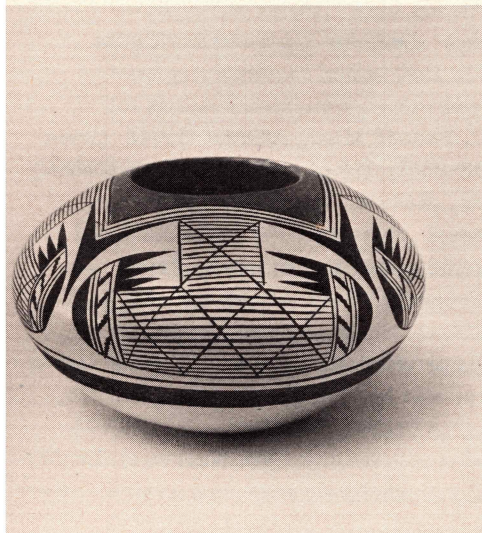
Hopi, Arizona - Pottery bowl; coil built, painted decoration.