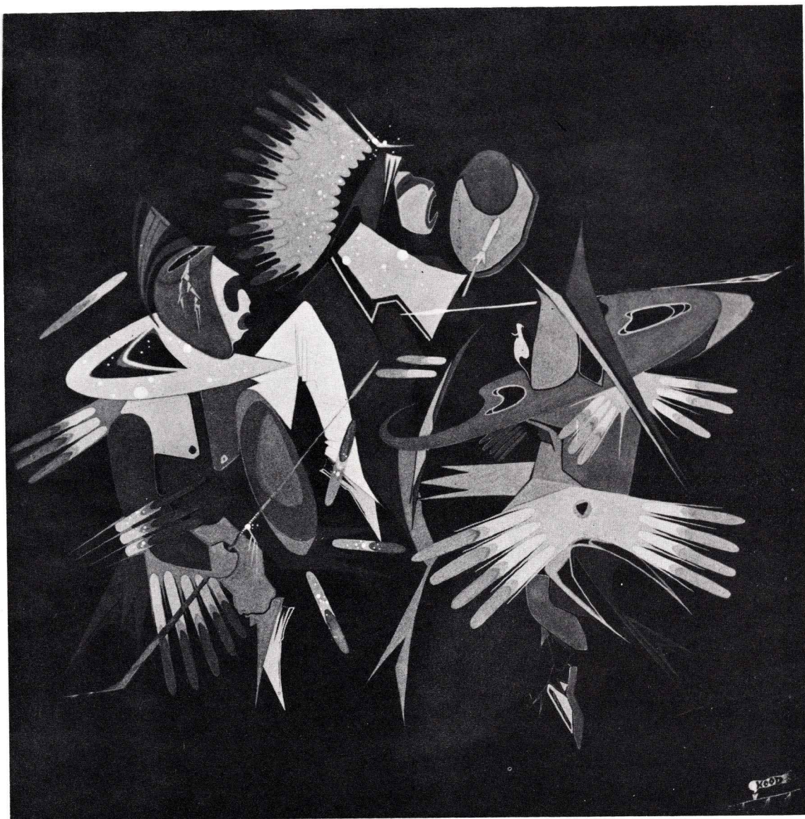
2. SHIELD DANCE. 1969. Tempera-casein- acrylic on matboard, 30"x29½". Collection U.S.D.I. I.A.C.B., Southern Plains Indian Museum and Crafts Center.